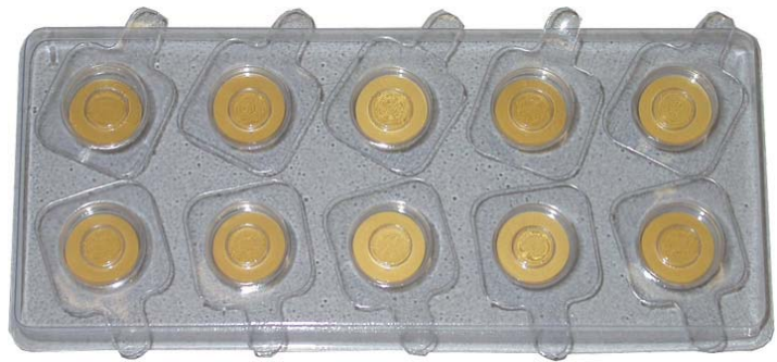
500-117 - 10 Pack Gold Crystals